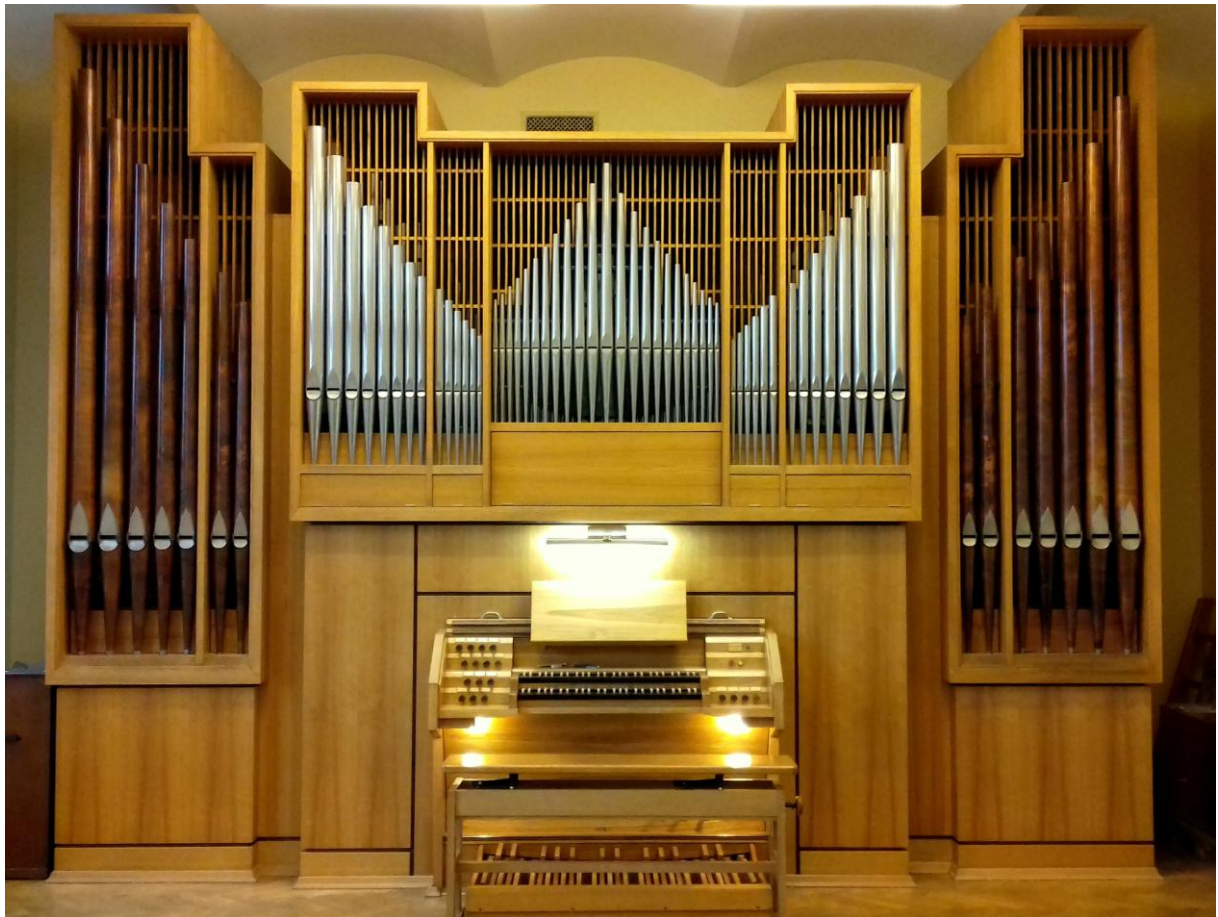
The organ of Schuke Company (Potsdam) op. 516