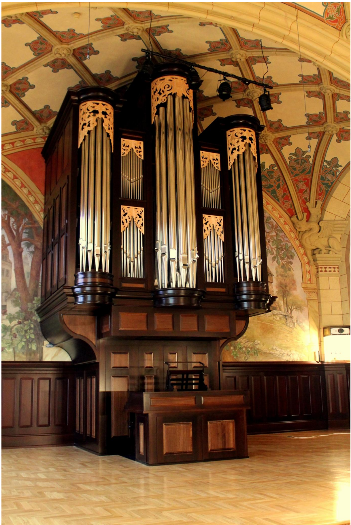
The organ of Anton Škrabl Company